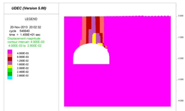
Figure 3: Rock displacements at the end of the excavation (in meters).